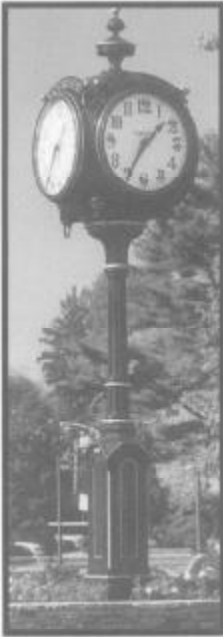
Sample Rendering of Proposed Clock

SPONSOR THE ASTON TOWNSHIP CLOCK AND YOU WILL RECEIVE A COMMEMORATIVE OPERATING CAST MINIATURE OF THE STREET CLOCK